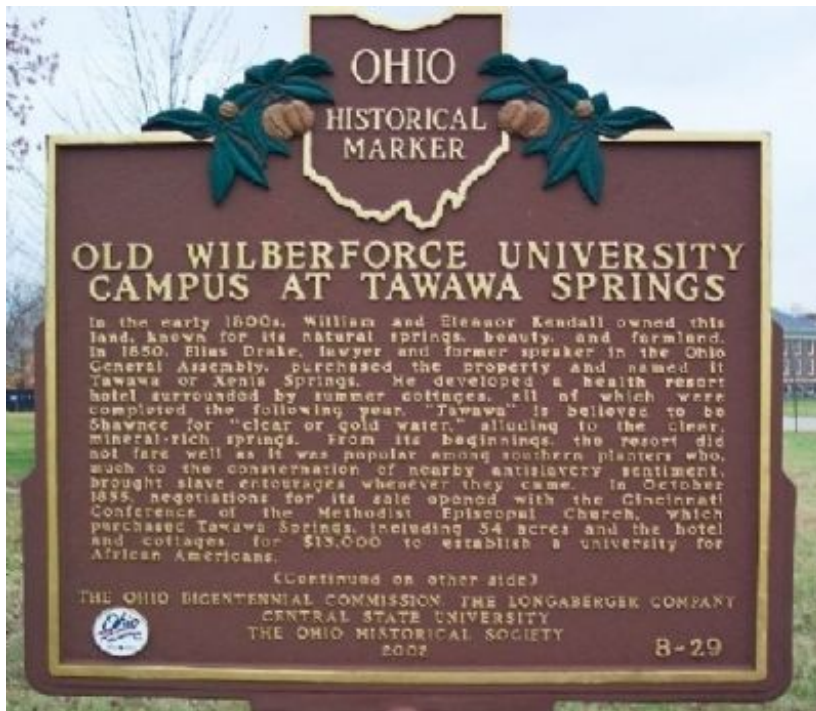
Tawawa Springs Historical Marker

I was born and raised in Detroit, MI. After my freshman year of college, my family moved all the way south to Atlanta, GA. My freshman year of high school was when the movie "Drumline" was released, and instantly I had joined my high school marching band. My band directors were from Southern University and Jackson State University and they always spoke so high of not just their institutions, but all HBCUs