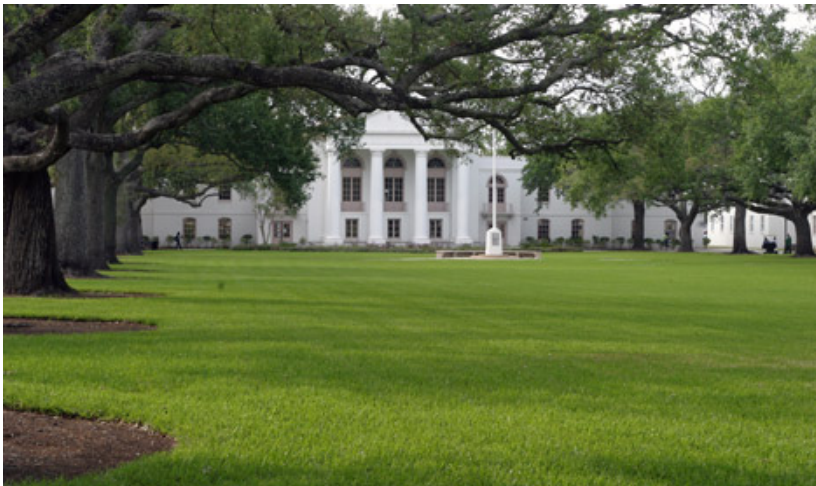
An Image of Haygood - Holsey Hall on Paine College's Beautiful Campus"