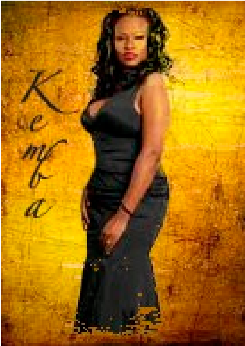
Miss KSU '95