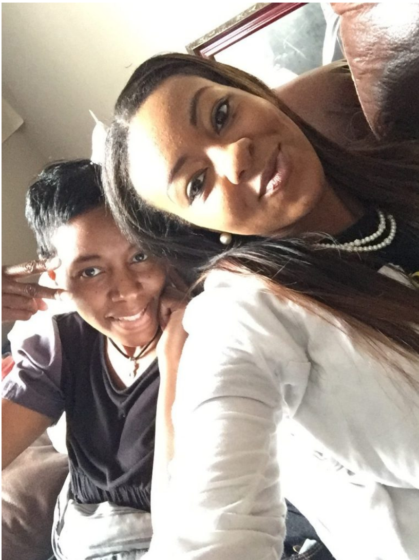
"Inspiration"

I an from a small town called Linden, Al & my mother introduced me to HBCU'S