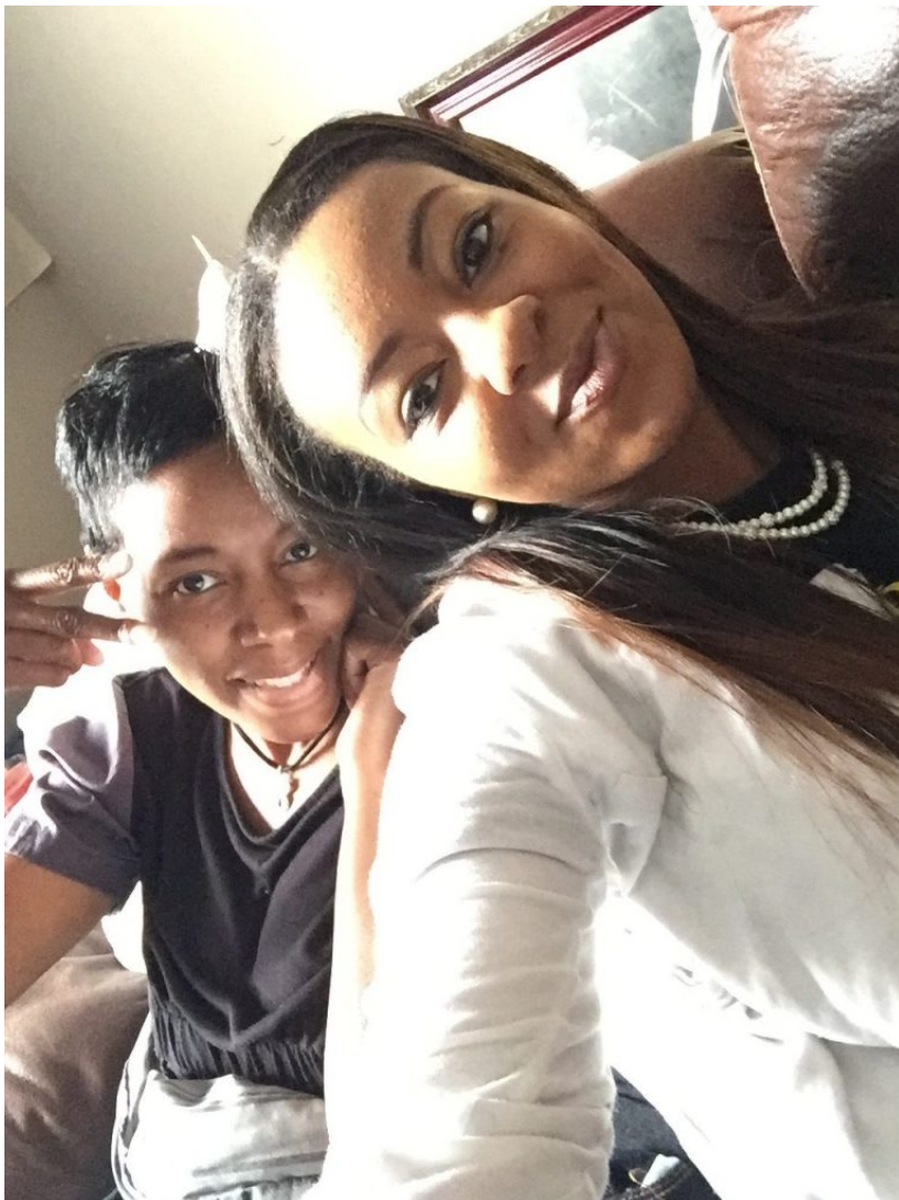
"Inspiration"

I am from a small town called Linden, AL & my mother introduced me to HBCU'S